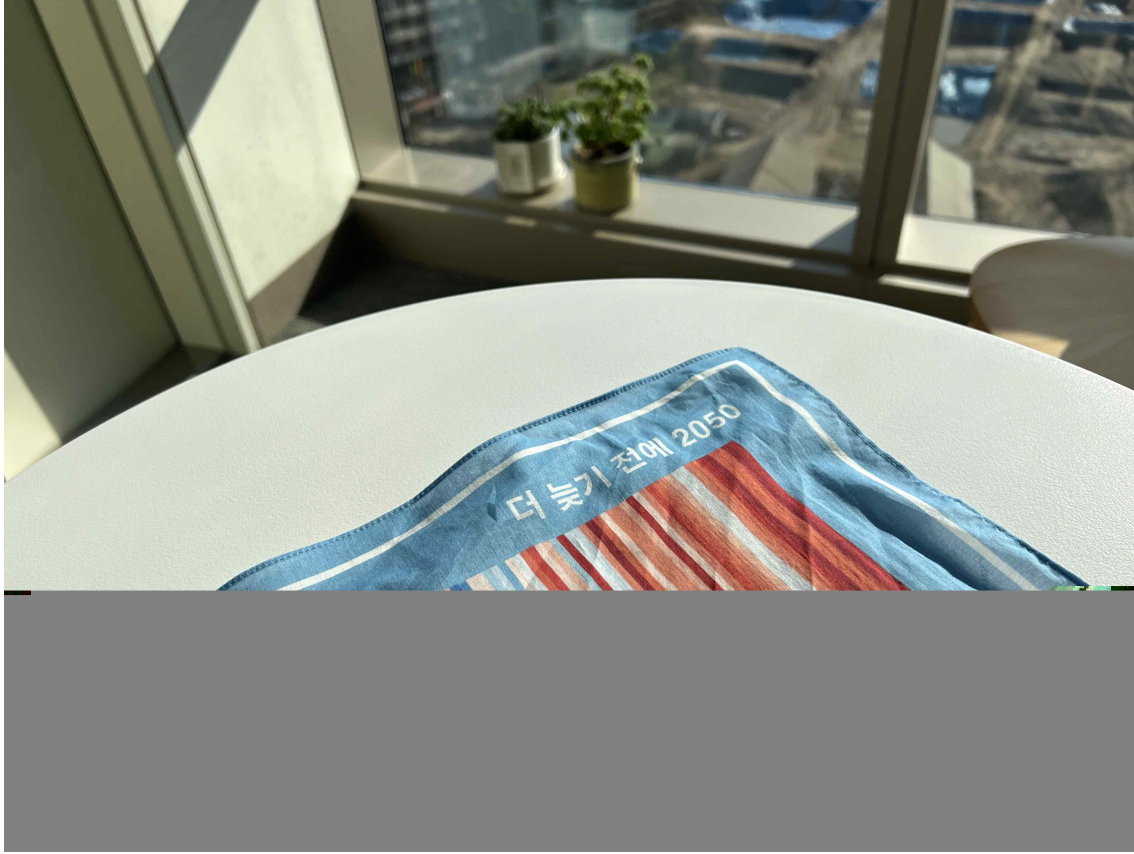
Image of Korea' s warming striped handkerchief